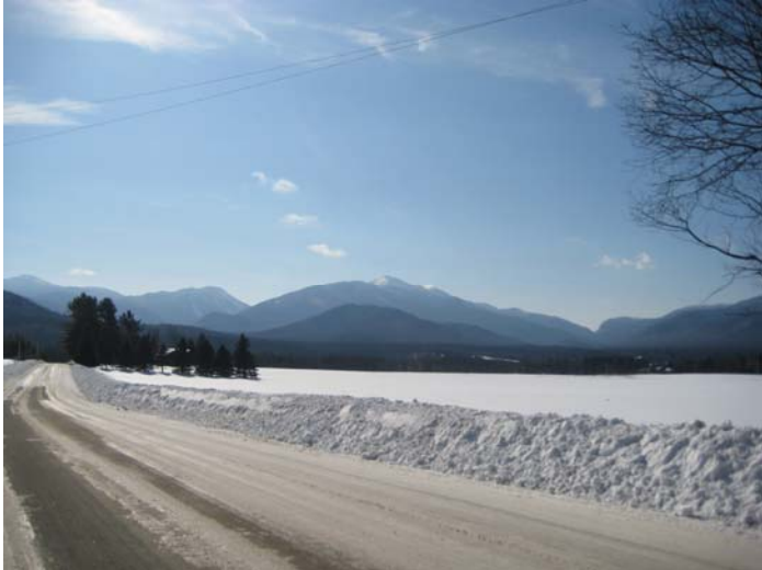
(road to the Loj with high peaks centered)

Twelve Susquehanna chapter ADKer's enjoyed three wonderful days in the North Country, February 2 - 4. They had excellent snow and perfect weather for skiing as well as for driving. It takes a bit less than four hours to get to the Loj, - up the Northway and then Rt 73, toward Lake Placid. The high peaks tower above the valley on the entrance road to the Loj.